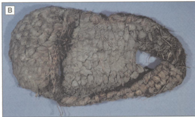
Fig. 1. (A) Specimen 2, a 25.3-cm-long padded sandal with a pointed toe, a slinglike heel formed from twisted lengthwise elements, and a warp-faced interlacing sole. The tie system consists of side loops and a braided cord that criss-crosses through the loops and over the foot and is secured at the ankle. (B) Specimen 5, a 24.5-cm-long slip-on with a rounded toe and a round-cupped heel. A row of two-strand Z-twist twining and a row of what appears to be a form of looping were used to secure the lengthwise elements at the heel. (C) Specimen 3, a 29.0-cm-long slip-on that has a rounded toe, a slinglike heel formed from twisted lengthwise elements, and a sole produced by a combination of two-strand, S- and Z-twist twining at the heel and 1/1 interlacing at the middle and toe.