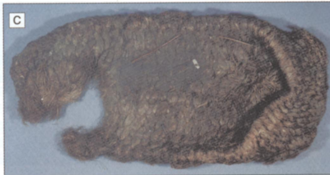
Fig. 2. (A) Specimen 7, a slip-on with a rounded toe and what probably was a round-cupped heel. (B) Specimen 1, a 30.0-cm-long slip-on with a rounded toe; a round-cupped heel form constructed of 12 sets of two-ply, Z-twist lengthwise elements; and warp-faced interlacing on sole and sides. (C) Specimen 4, the only example with both a twined body and sole, is a 27.0-cm-long slip-on with a rounded toe and a round-cupped heel. The sole of the shoe is of double thickness.