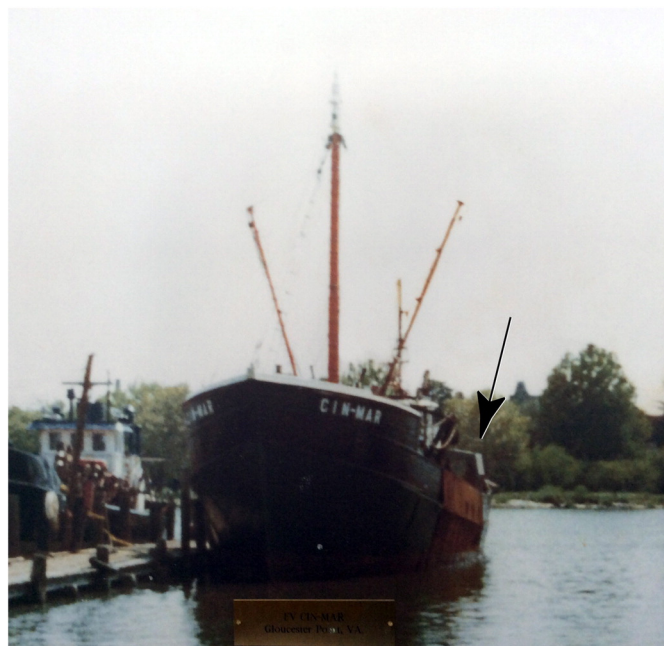
Fig. 3. Photograph of the Cin-Mar fully constructed and docked. Note that the plaque affixed to the photograph identifies the boat as fishing vessel (FV) Cin-Mar of Gloucester Point, Virginia. Although the vessel was officially renamed The Misty Cape , the vessel sank before the name was applied to the hull. The arrow pointing to the stern indicates that the Cin-Mar in Bayley's photograph has a transom that extends upwards above the side rails of the boat. The transom of the boat shown by Stanford and Bradley does not extend above the side rails (compare with Stanford and Bradley (2014: 619), Fig. 2).

Moreover, Stanford and Bradley (2014: 619) provide an image of the Cinmar under construction, “illustrating its small size relative to modern scallop vessels.” The small size of the vessel in this image contradicts the registered dimensions of the Cinmar , its relative size to all other registered wooden-hulled fishing vessels as indicated by our statistical analysis (Fig. 1), as well as its historical description as the “largest boat built and launched in Gloucester County” (Daily Press [Newport News, Virginia], 2006). We thus obtained images of the Cinmar from its builder, J. E. Jordan of Gloucester, as well as from Captain Bayley (Figs. 2–3). Our images question whether the vessel shown in the image provided by Stanford and Bradley is Captain Shawn's Cinmar . Beyond the obvious differences in color and shape, and the fact that the vessel depicted in our images matches the size of Captain Shawn's Cinmar , the reader should note that “ Cinmar ” is spelled correctly, i.e., “ Cin-Mar ,” on the hull of the boat in the image provided by Captain Bayley.